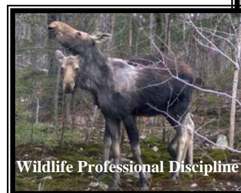
Wildlife Professional Discipline