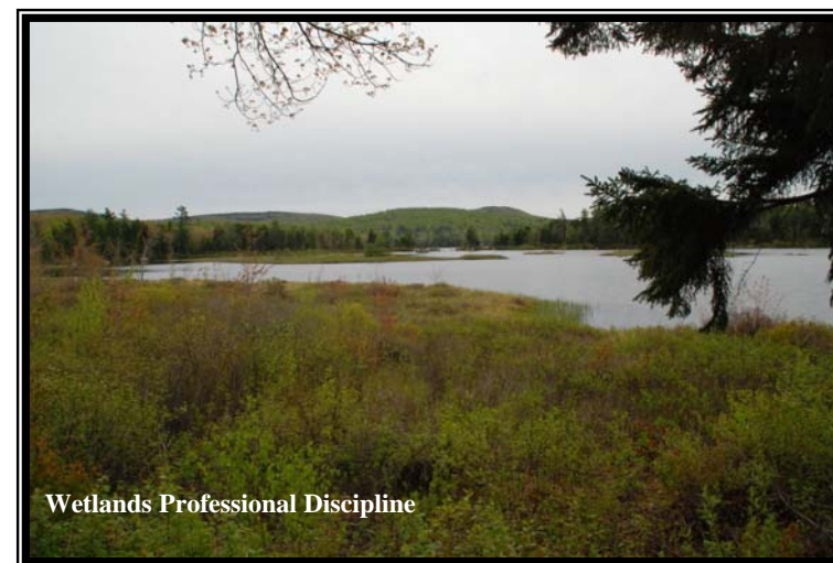
Wetlands Professional Discipline