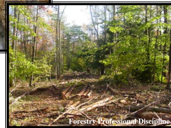
Forestry Professional Discipline